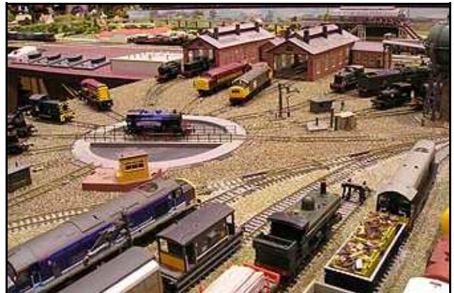
Watford & Anything from Invercargill