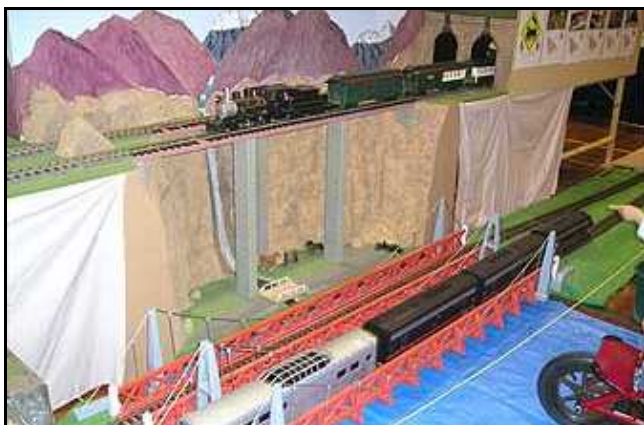
G scale Bridges