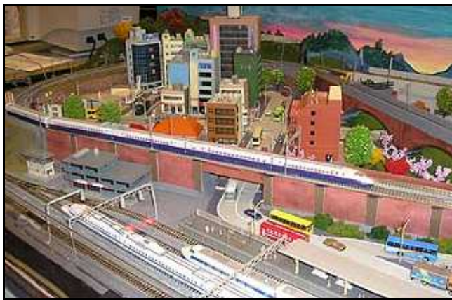
David Woolf's Ko-Opjara computer controlled N