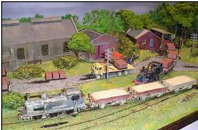
Butterwick OO scale