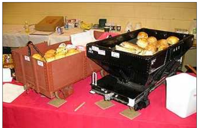
Wagon loads of food at the cafe