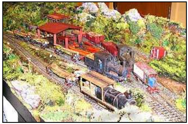
Colonial Bush Tram from Hokitika