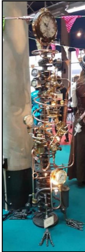
Steampunk models made with second hand parts.