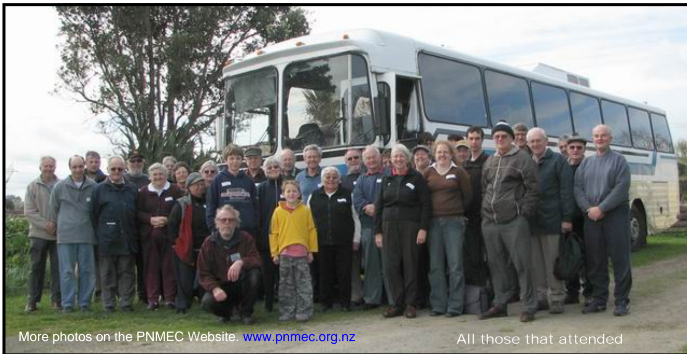
More photos on the PNMEC Website. www.pnmecc.org.nz