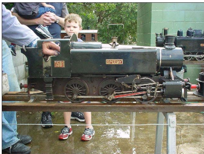
"Speedy" up from Wellington.