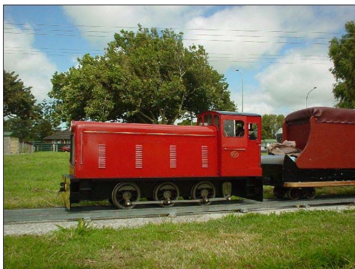
Les Fordyce's "DSA"