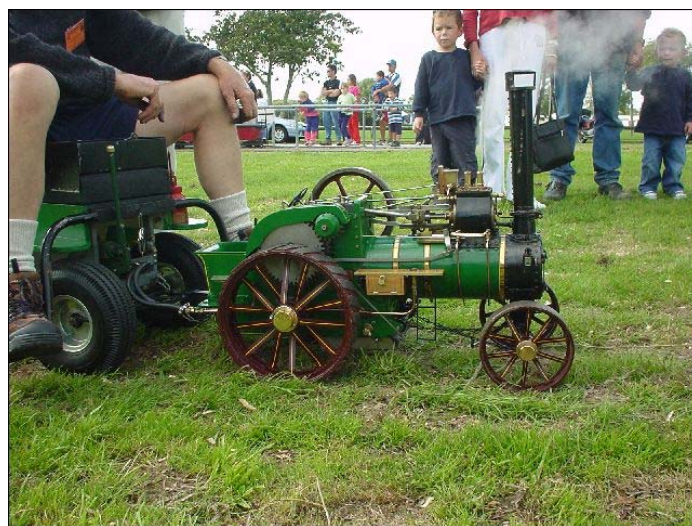
Bruce Geange's D&NY Traction Engine