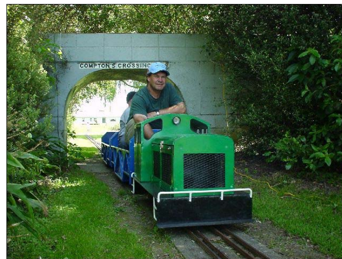
" Kermit" under Compton's Crossing